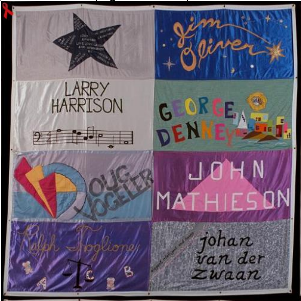
Names(panel number) on Block # 103

Leader -3: Hello. My name is _____. I am in_(city) _____, _(State)_____. Scroll the page to see the panel names on Block # 103.