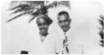
Promising Florida voting rights bill honors little-known civil rights martyrs